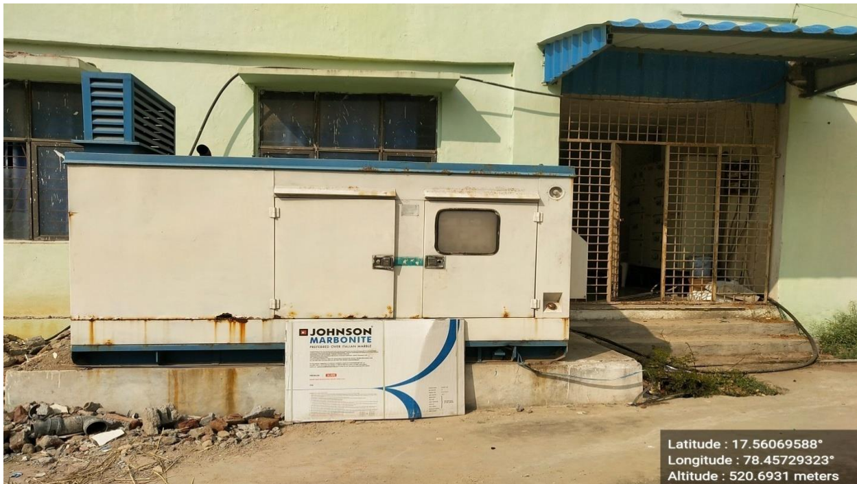
Snapshot of MRCET Canteen

Latitude : 17.56069588° Longitude : 78.45729323° Altitude : 520.6931 meters