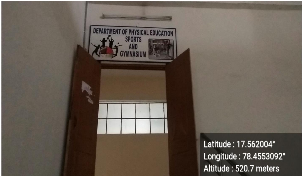
Snapshot of MRCET Sports and Gymnasium-Entrance