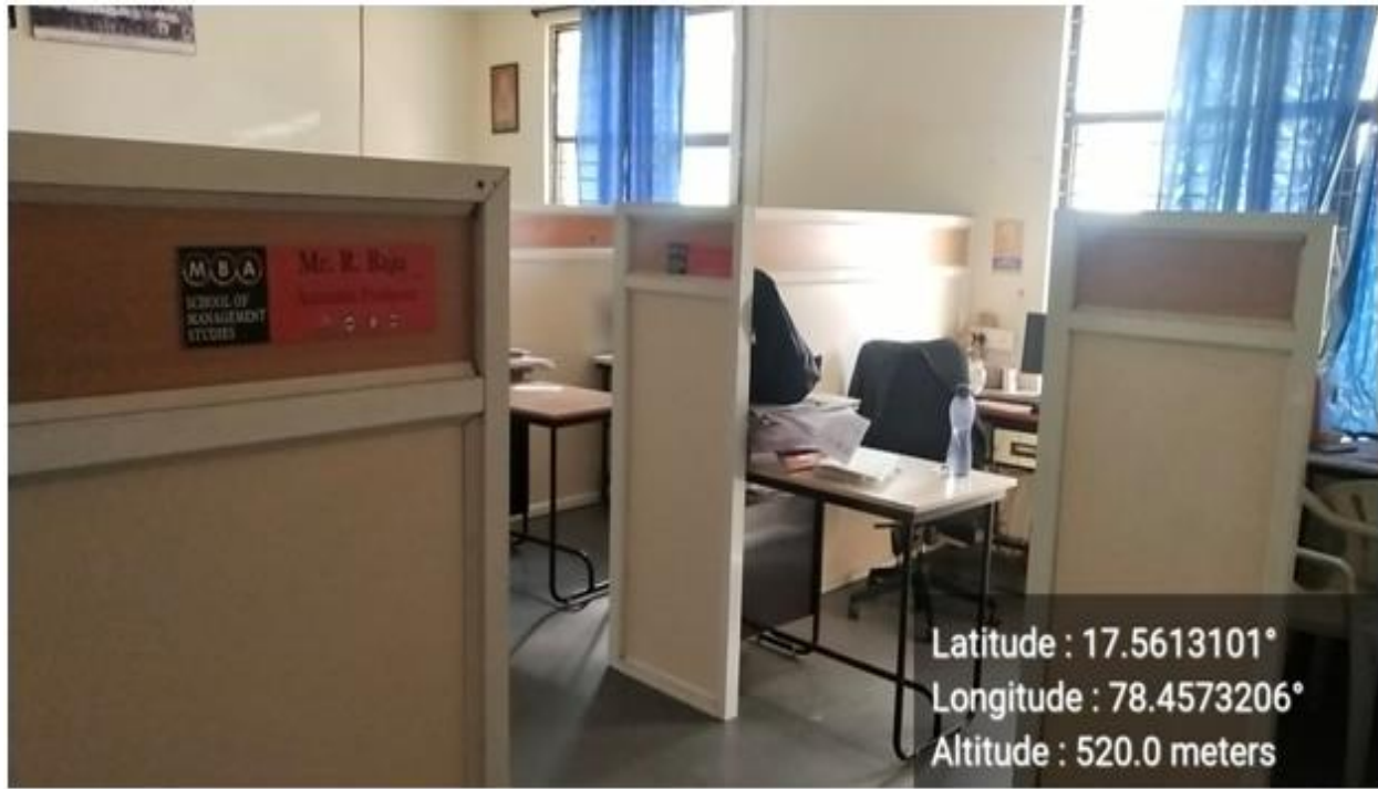
Snapshot of Department Staff Rooms