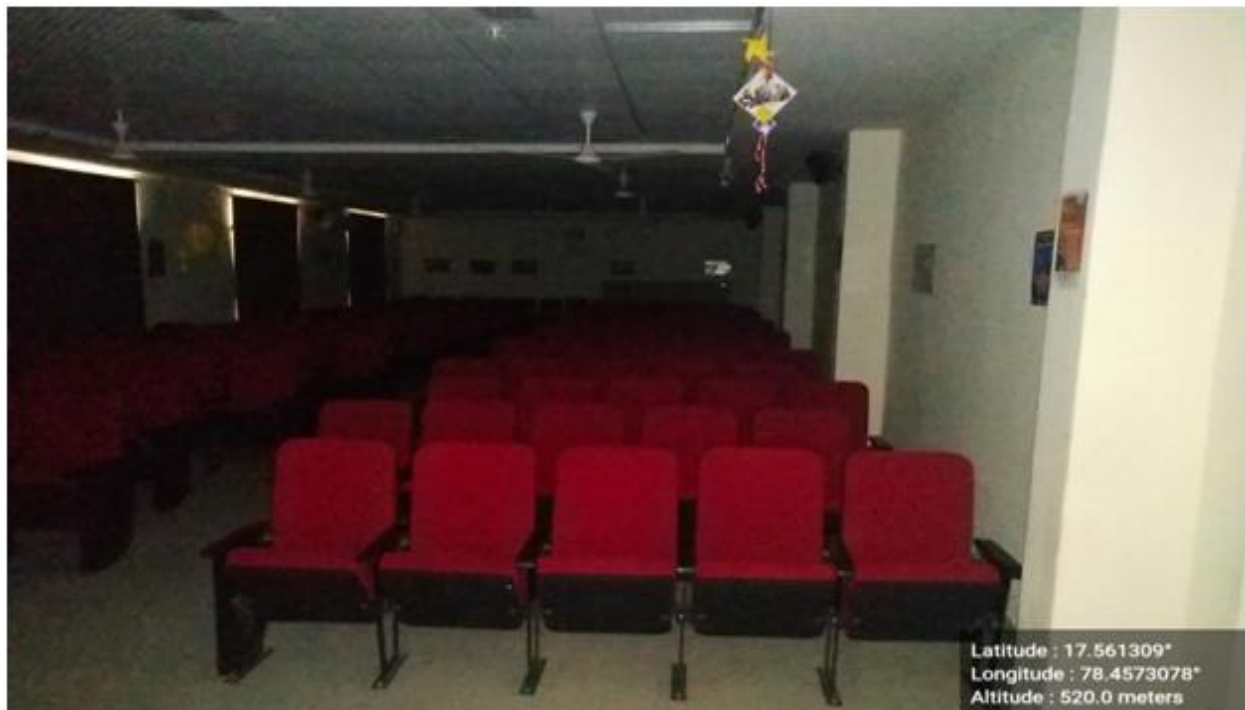
Snapshot of Seminar Hall