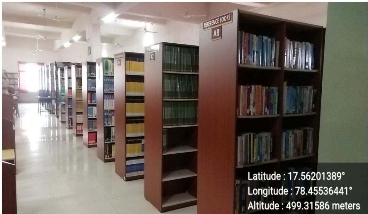
Snapshot of MRCET Library