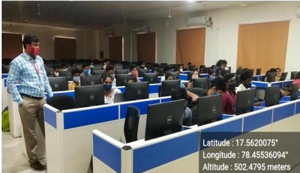
Snapshot of Lab Infrastructure