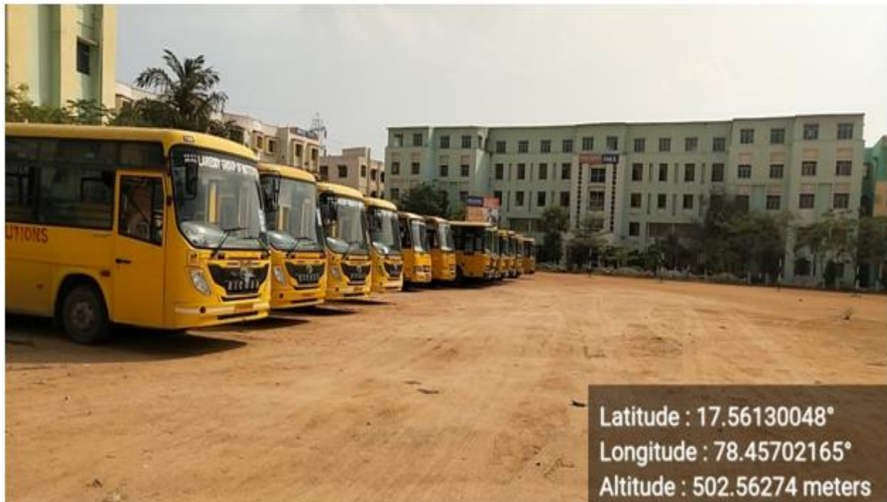
Snapshot of MRCET Buses for Staff and Students