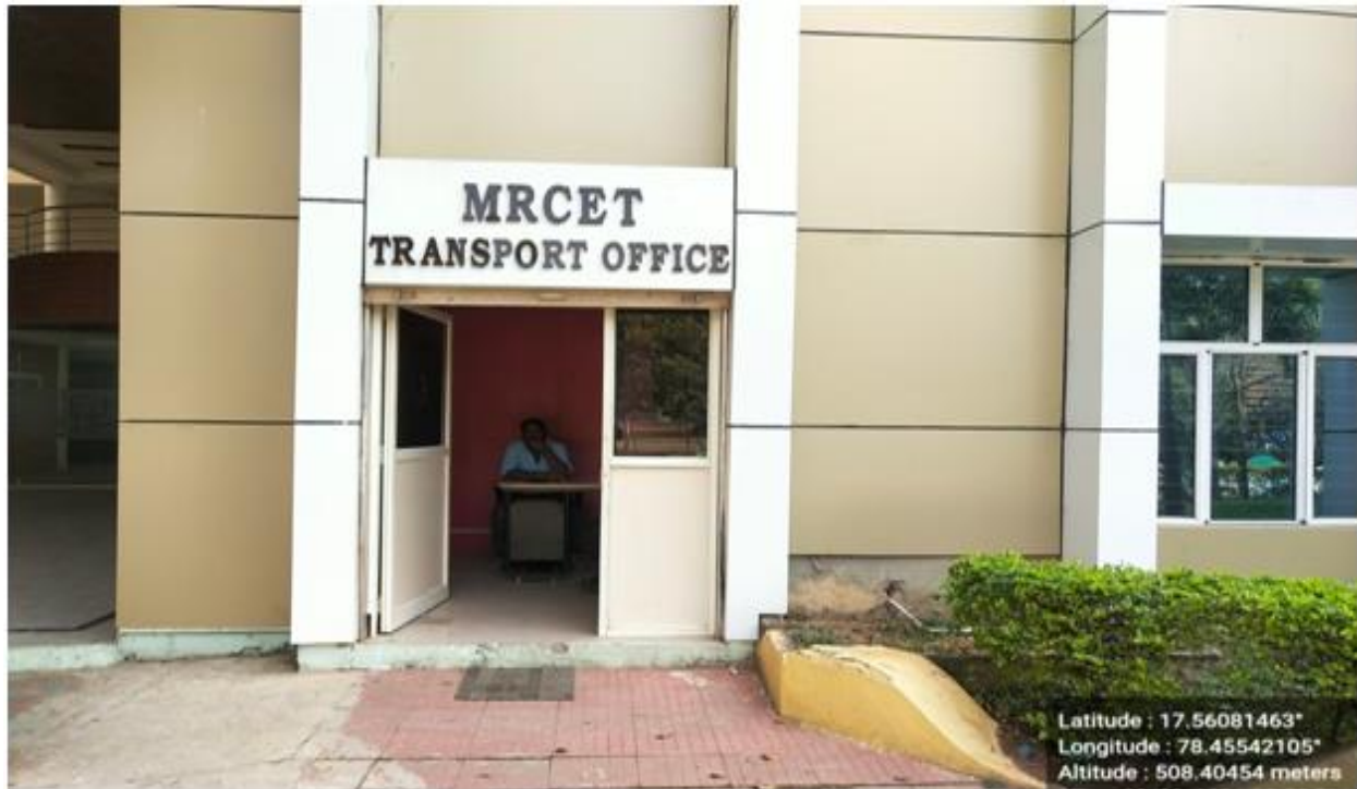
Snapshot of MRCET Transport Office