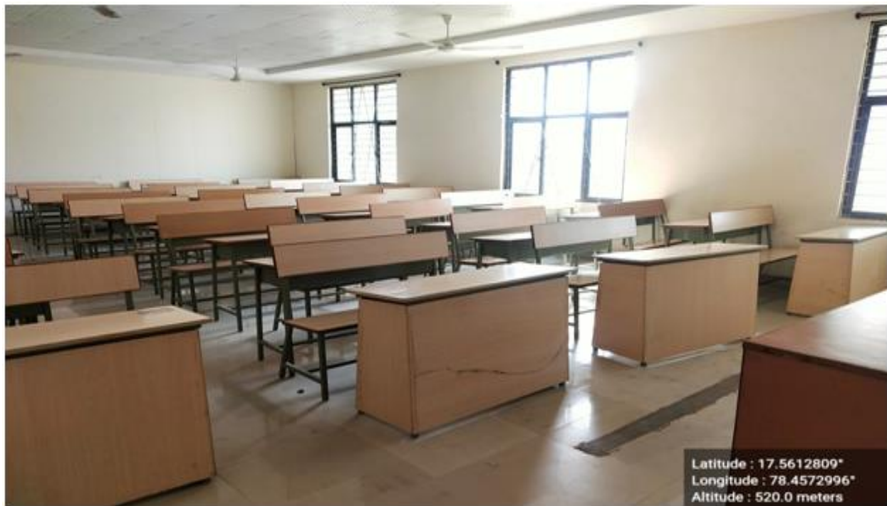
Snapshot of Lecture Hall