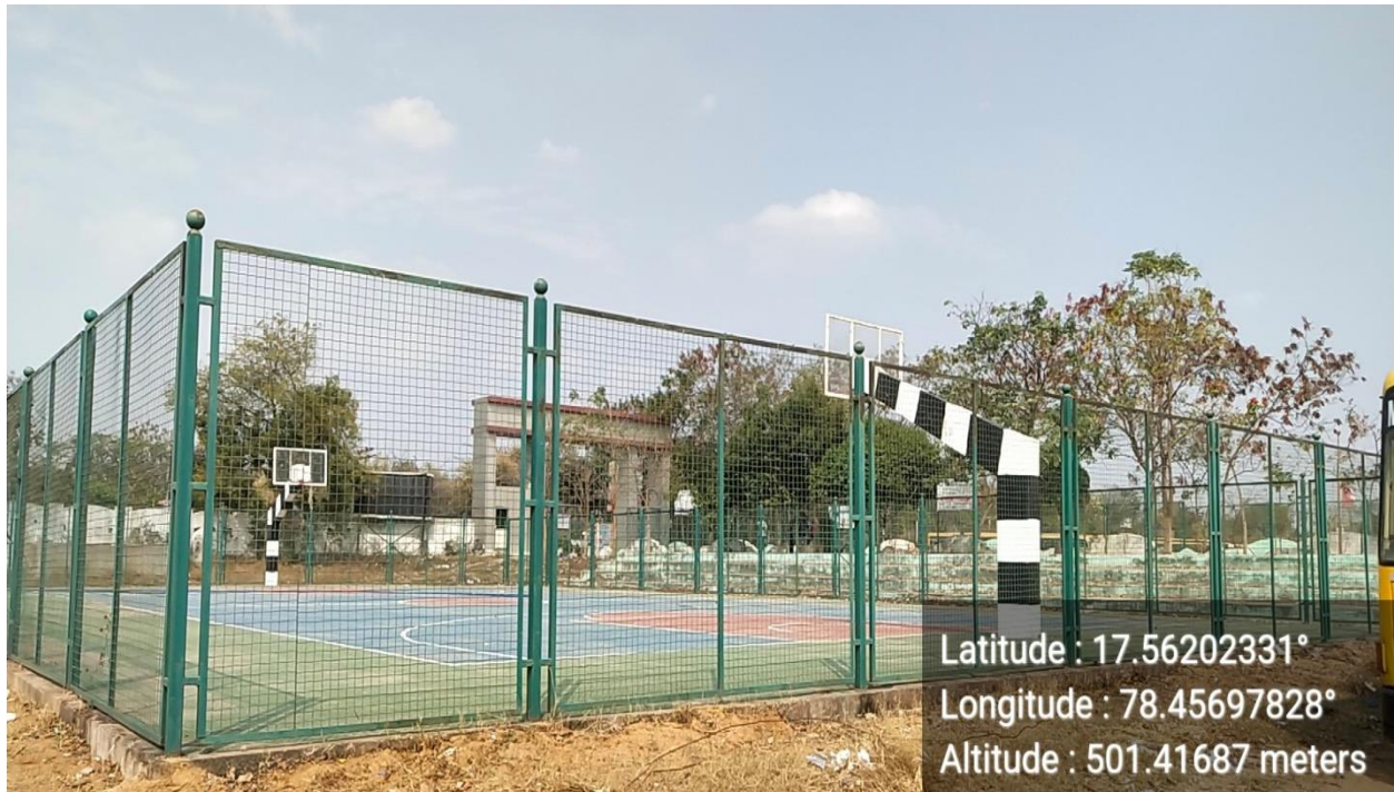
Snapshot of MRCET Play Ground-Basket Ball Court