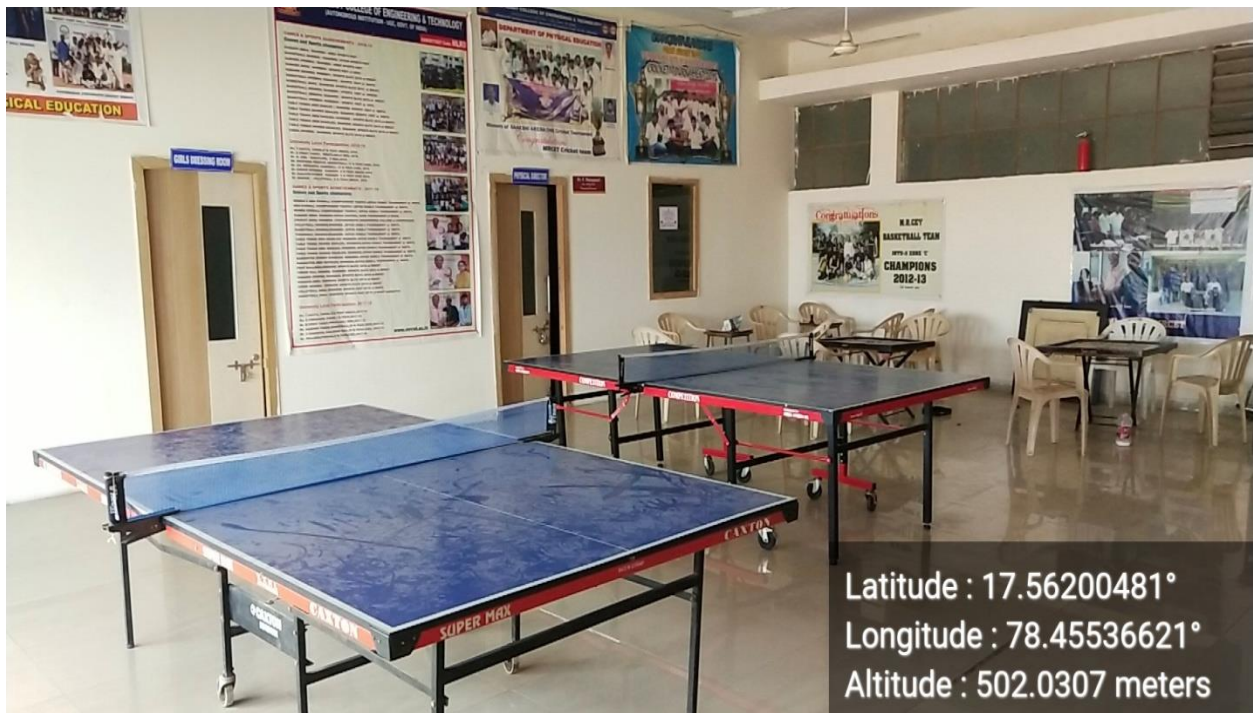
Snapshot of MRCET Sports and Gymnasium