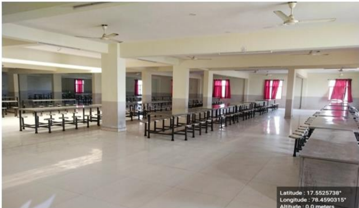
Snapshot of MRCET Hostel Dining Room