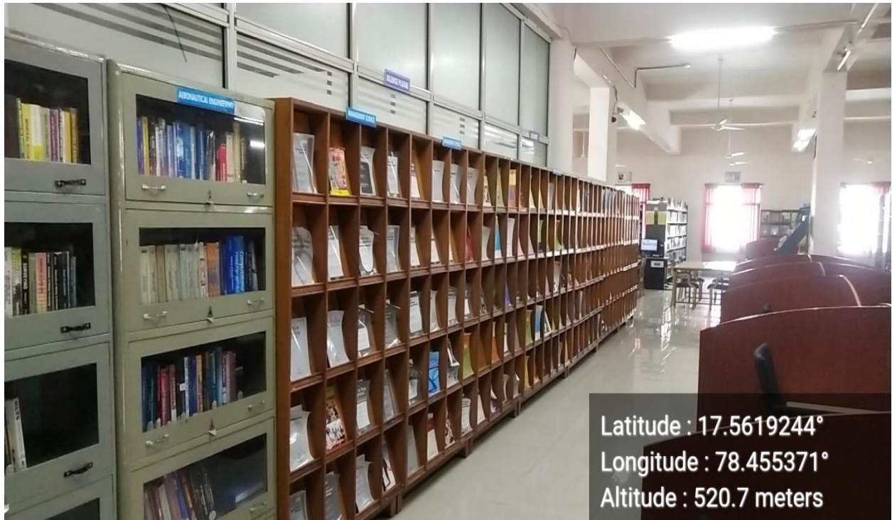
Snapshot of MRCET Library