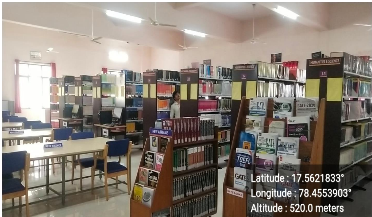
Snapshot of MRCET Library