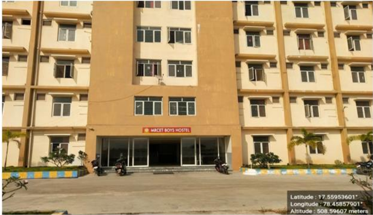
Snapshot of MRCET Boys Hostel