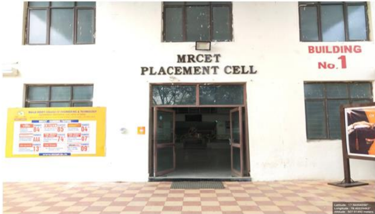
Snapshot of MRCET Placement Cell