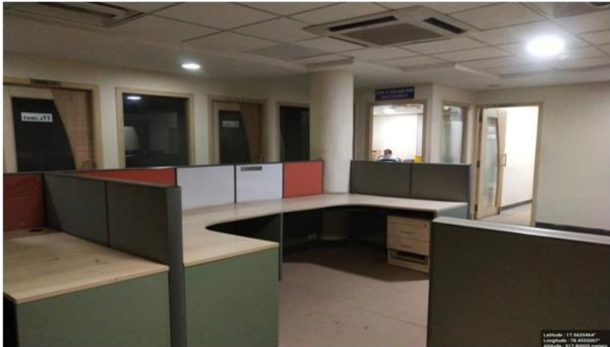
Snapshot of MRCET Placement Cell (Inside View)