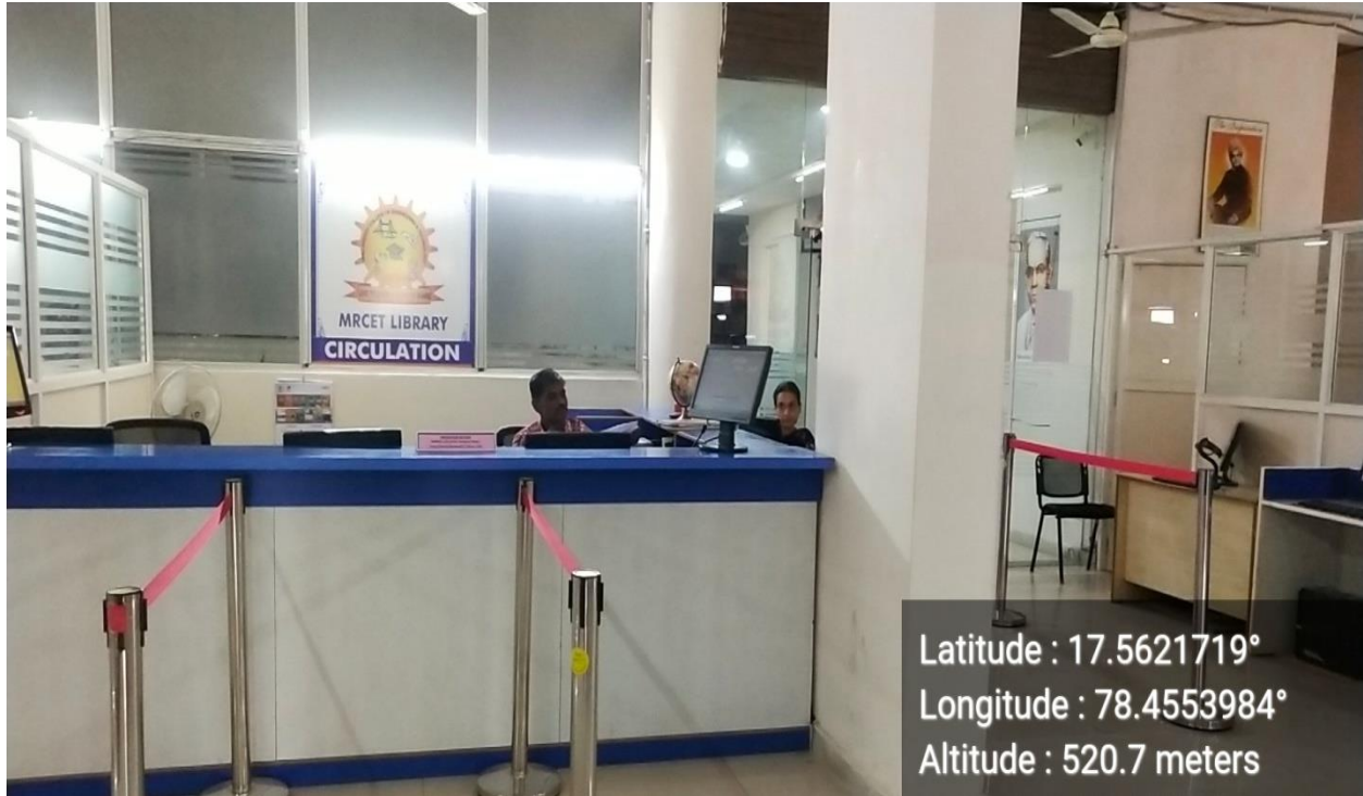
Snapshot of MRCET Library-Entrance inner view