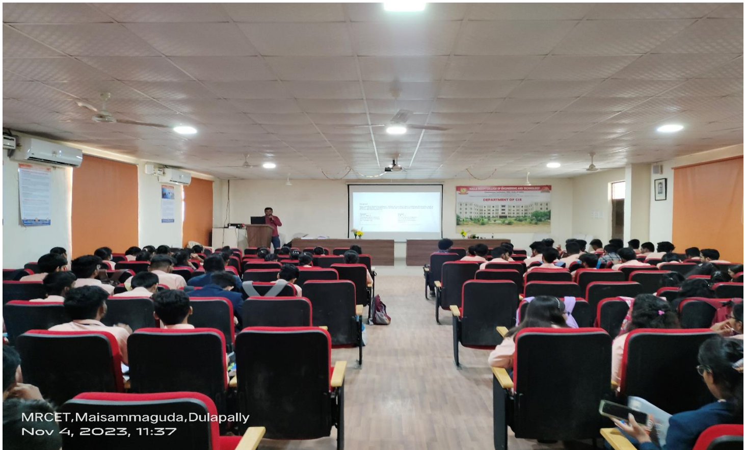
MRCET, Maisammaguda, Dulapally Nov 4, 2023, 11:37