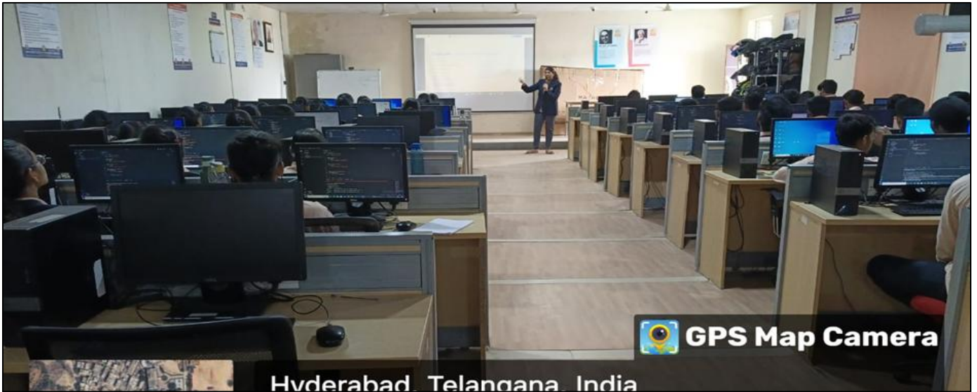
Hyderabad, Telangana, India