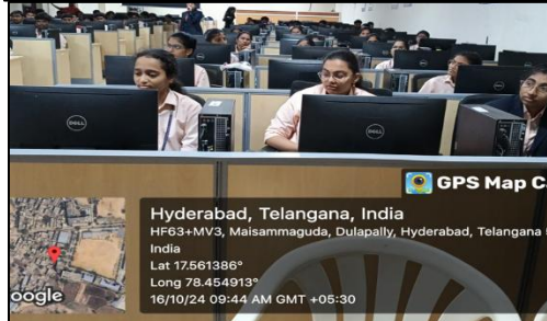
Hyderabad, Telangana, India HF63+MV3, Maisammaguda, Dulapally, Hyderabad, Telangana India Lat 17.561386° Long 78.454913° 16/10/24 09:44 AM GMT +05:30